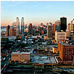
Way Out West