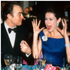
When a Pouf Skirt Said It All