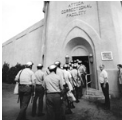
State Seeks Release of Report on Attica Uprising